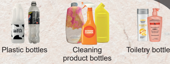
Plastic bottles Cleaning product bottles Toiletry bottles