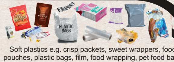
Soft plastics e.g. crisp packets, sweet wrappers, food pouches, plastic bags, film, food wrapping, pet food bags