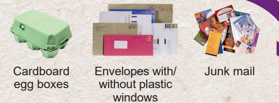
Cardboard egg boxes Envelopes with/without plastic windows Junk mail