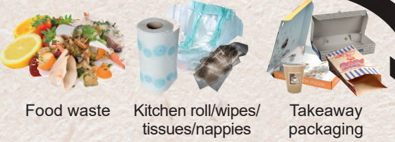
Food waste Kitchen roll/wipes/tissues/napies Takeaway packaging