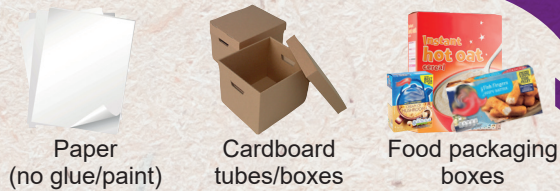
Paper (no glue/paint) Cardboard tubes/boxes Food packaging boxes

Anything wet or damp please place in black bin