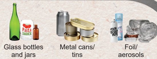
Glass bottles and jars Metal cans/tins Foil/aerosols