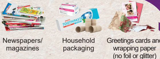
Newspapers/magazines Household packaging Greetings cards and wrapping paper (no foil or glitter)

Flatpack all boxes and remove as much tape as possible. Staples in magazines are acceptable.